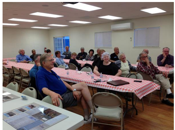
Speaker has everyone's attention