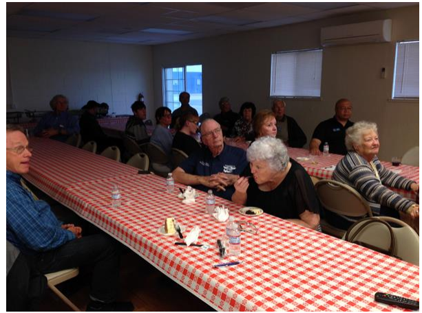
Everyone interested in the speaker except his wife who has heard it all before, so she decided to enjoy the fabulous dessert!