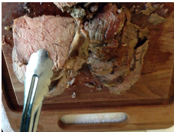
Look what you missed – perfectly cooked prime rib!