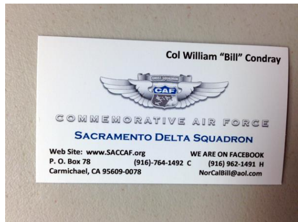
Information from the CAF