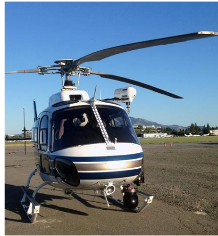
Close up view of N341HP.