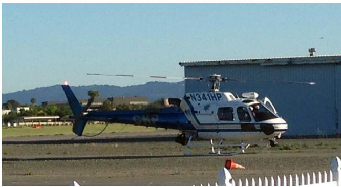
CHP helicopter upon arrival.