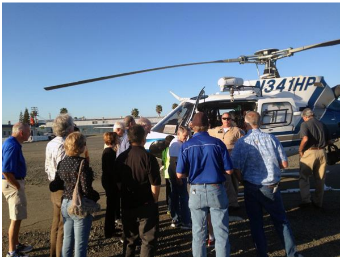
Our group being told how to avoid being caught on radar.