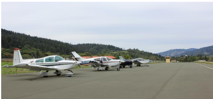
Our "horses" ☺