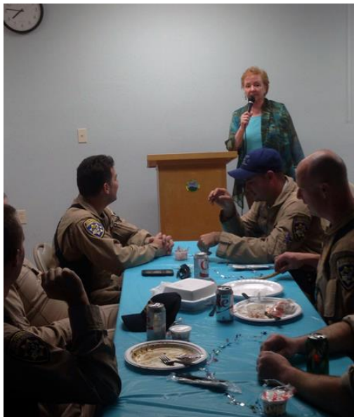
Introduction of our speakers.