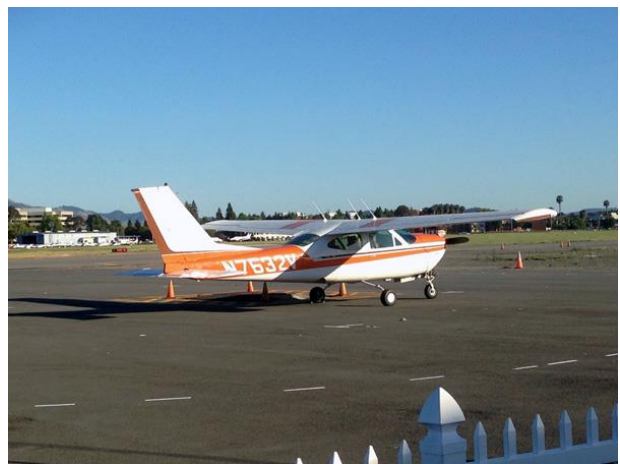
Some arrive in style (such as The Thacker’s)!