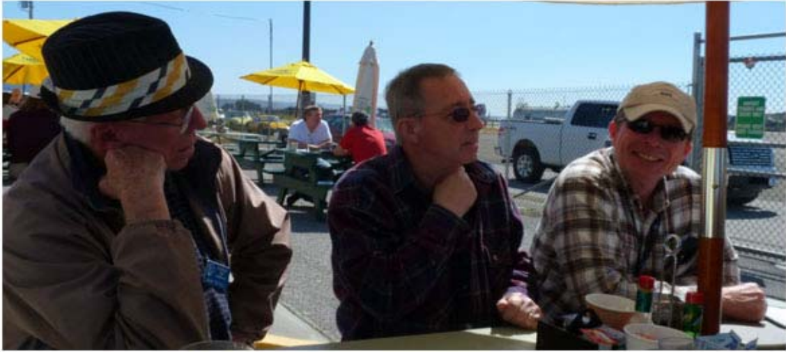
Fly-in to Half Moon Bay