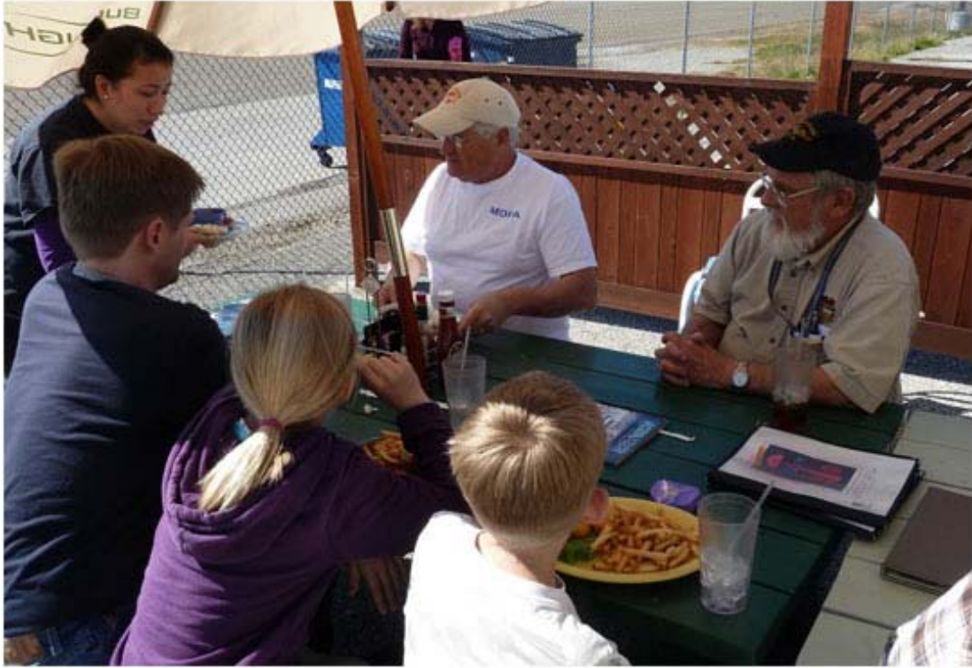
Fly-in to Half Moon Bay March 2012

These two pages of photos are from the Fly-in to Half Moon Bay on March 3 rd , 2012 (They did not make it into the March newsletter).