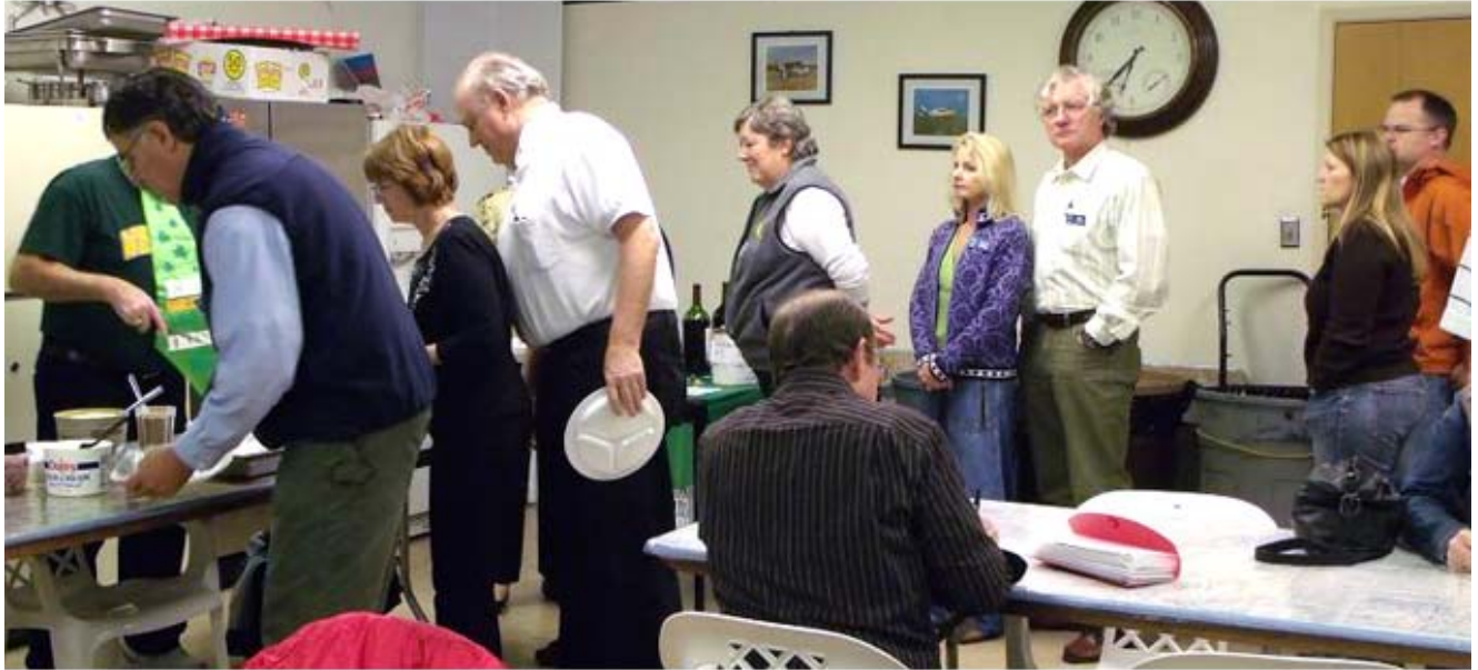
Queued for food