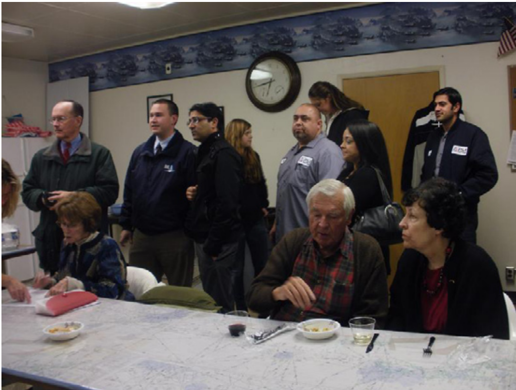
Waiting for dinner