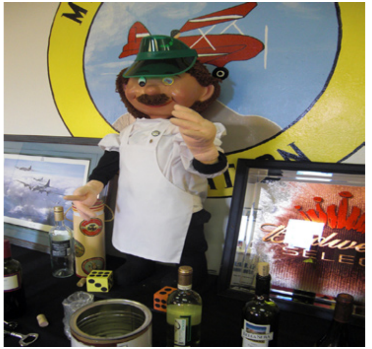
June - Casnio Nite Little Man with the Valuable Prizes for the winners