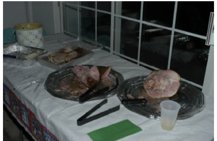
Remains of the Night