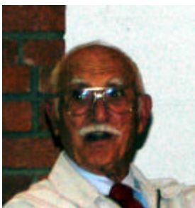
I picked it