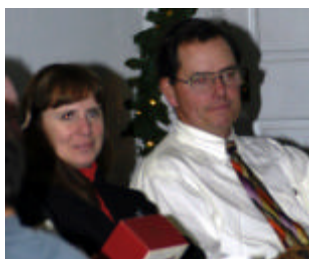
We stole it